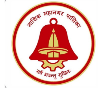
3 rd Position Nashik Municipal Corporation, Maharashtra