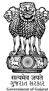
2 nd Position Gujarat