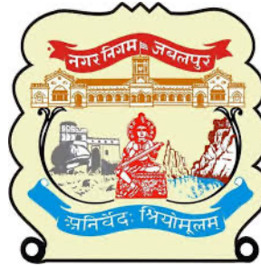
1 st Position Jabalpur Municipal Corporation, Madhya Pradesh