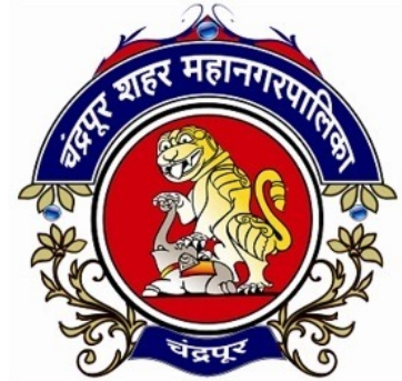
3 rd Position Chandrapur Municipal Corporation, Maharashtra