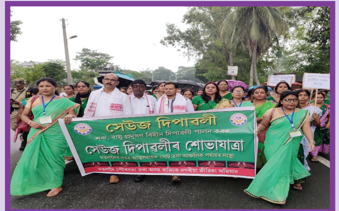
Self Help Groups conducted rally to create awareness pollution free Diwali and sensitise to use earthen lamps at Mangaldai, Assam.