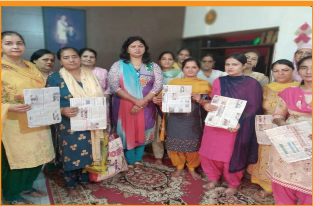
Self Help Groups in Punjab making eco-friendly products including paper bags and diyas.